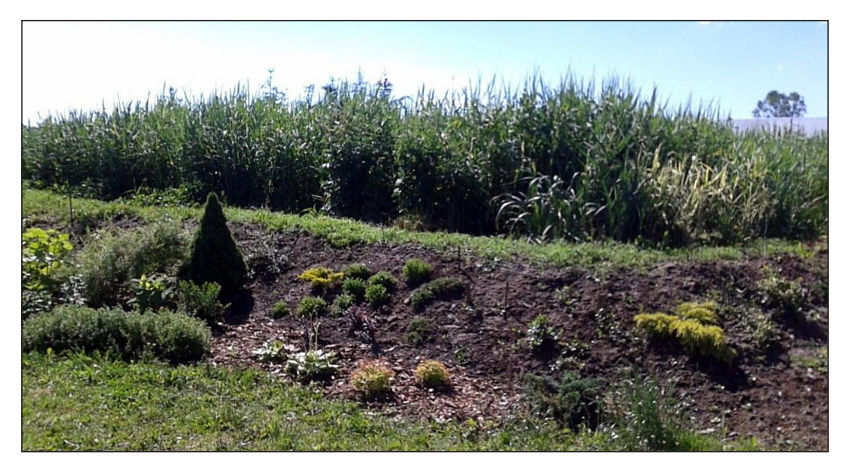
Figure 1. Constructed wetland sewage treatment plant

Concentration of organic soluble contaminants S<sub>COD</sub> was determined in raw sewage as COD of wastewater.